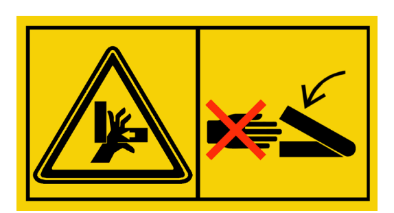
Danger of jamming fingers